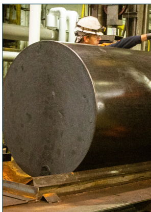
Block of extruded graphite