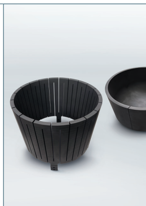
Isostatic graphite parts for a silicon solidification furnace