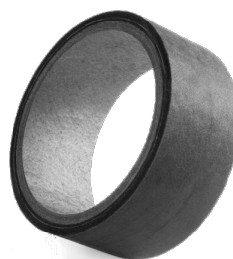
Insulating felt for furnaces