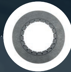
C/C COMPOSITES 2D / 2,5D AEROLOR®