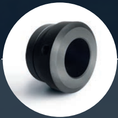
GRAPHITE ISOSTATIC / EXTRUDED