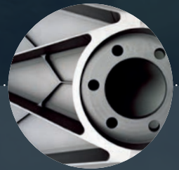
SINTERED SILICON CARBIDE BOOSTEC®

for engines, fluid handling and brakes with running temperature from -55°C up to 600°C in oxidizing atmosphere