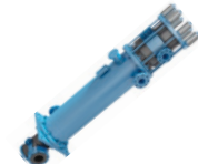
Tantalum shell and tubes