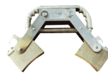
Power transmission systems with carbon brushes & brush-holders