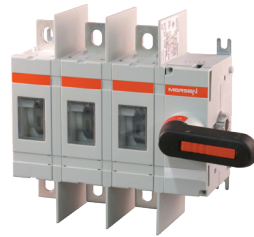
M200U30 with HD250 Direct Handle