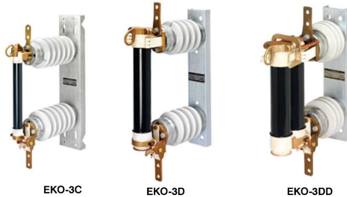
Fig. 3. Type EKO-1 fuse supports (outdoor)