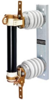
Fig. 5. EK-3D fuse-disconnecting switch in the closed position