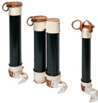
Fig. 7. Fuse units assembled with fittings for Type EK-3D, EK-3DD, and EK-3C fuse disconnecting switch