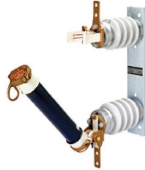
Fig. 6. EK-3D fuse-disconnecting switch in the open position