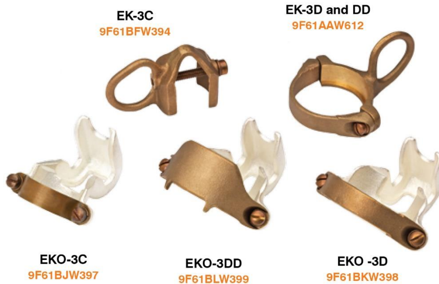
Fig. 8. Fuse fittings for Type EK-3 and EKO-3 fuse disconnecting switches