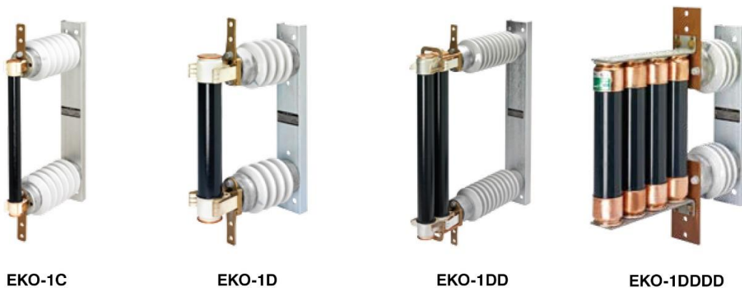
Fig. 4. Type EKO-3 fuse disconnecting switches (outdoor)*

* It should be noted that disconnecting switches are not load-breaking devices; therefore, the circuit must be open prior to the fuse disconnection.