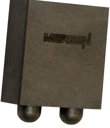
Mersen stick design