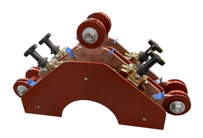
3D plug set view

Only a 90° twist of an insulated handle using one hand is now required to perform the carbon brush change safely. A specific guard also has been designed for the safety of the technician performing the work while the turbo generator is still producing.