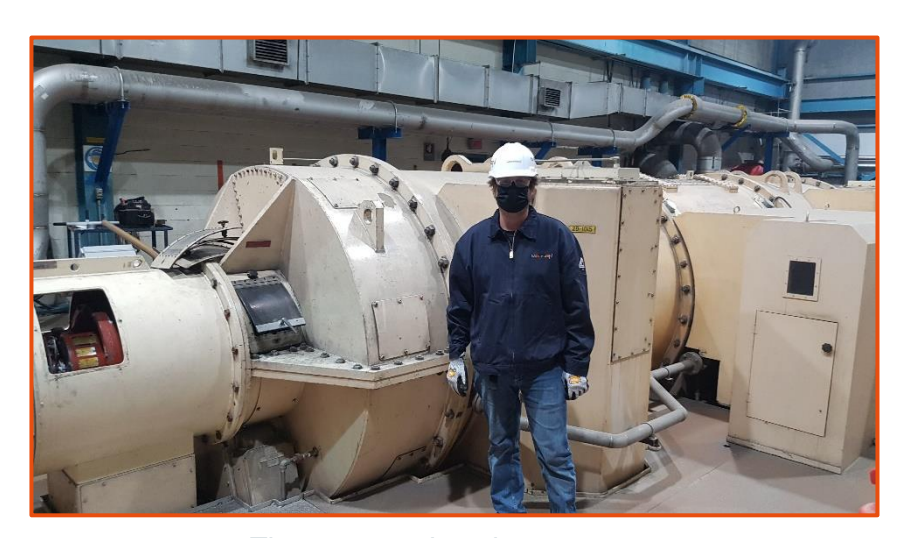
The customer's turbo generator